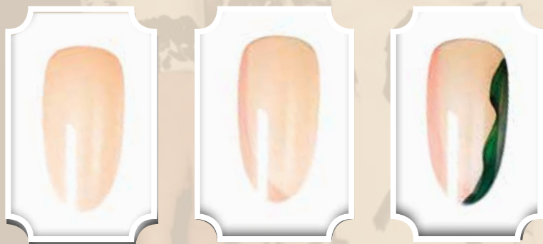
PALM FRENCH / CND® VINYLUX®