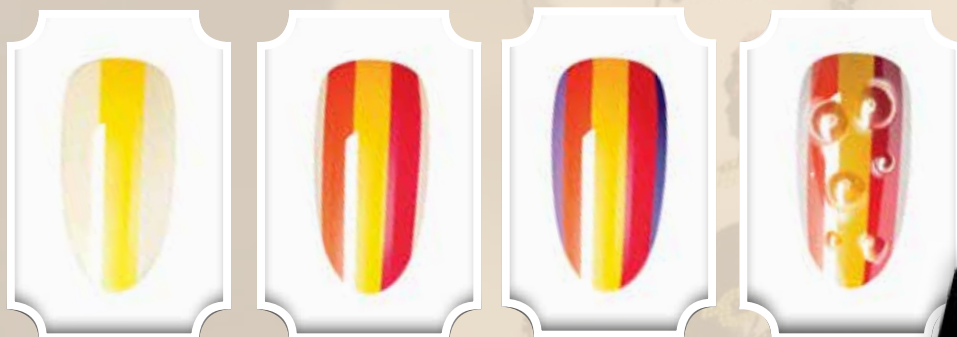
HARD CANDY / CND® SHELLAC®